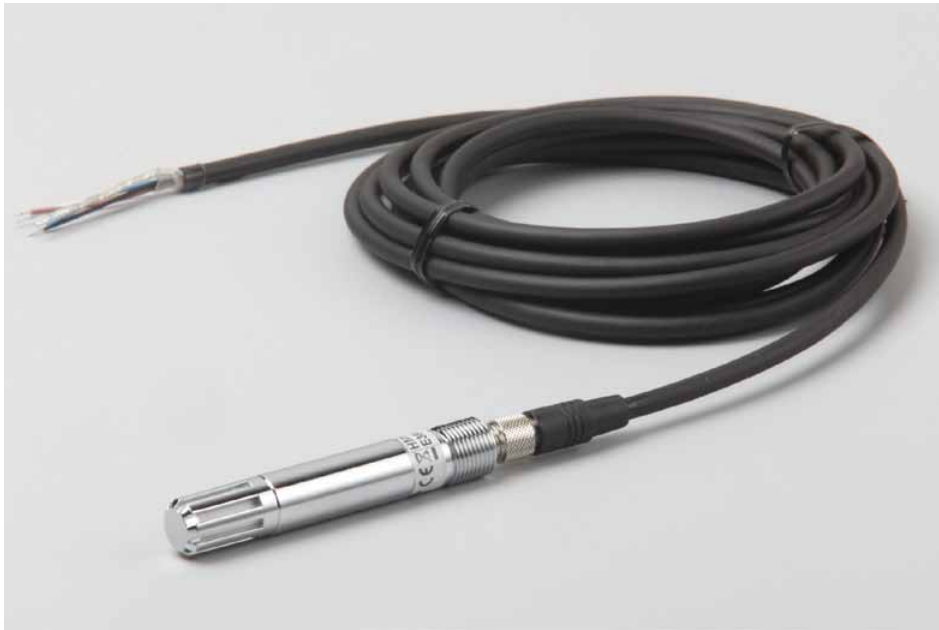
The HMP60 for extreme conditions.