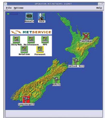
The IRISnet Network management tool lets you see at a glance the status of all radar & display systems. Operators can travel the network with a few clicks of their mouse.

The ingest files generated by the radar process are the starting point for the product generator. IRIS™ has the most comprehensive suite of products available in the industry today (see product summary page). The product configuration and product scheduler menus give operators full control over the details of the product generation and the mix of products for each operational mode. All products are made in the original polar coordinates of the radar data with correction for earth curvature and full interpolation. Resolution and map projection are selectable.