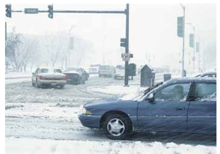
PWD-series sensors can be used in planning the road maintenance.

The PWD22 is equipped with two Vaisala RAINCAP® sensor elements to improve detection sensitivity during light precipitation events – even light drizzle is detected. The PWD22 also reports present weather in WMO METAR code format so it is easily integrated with AWOS systems.