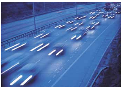
PWD12 is ideal for road weather applications.

The Vaisala Present Weather Detector PWD12 provides accurate visibility and present weather measurement in the road environment, where low visibility is a serious safety hazard and significantly reduces traffic flow rates. With a visibility measurement range of 10...2,000 meters, the Vaisala Present Weather Detector PWD12 is ideal for road weather applications. The PWD12 also indicates the cause of reduced visibility to give you a full picture of weather conditions. Its ability to detect precipitation and identify precipitation type gives the road authority valuable information for the short-range planning of road maintenance operations.