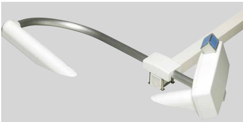
The Vaisala Present Weather Detector PWD22.