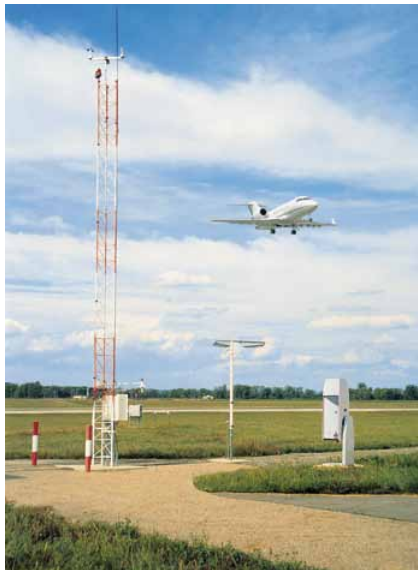
The PWD22 is recommended for Automatic Weather Observation Systems (AWOS).