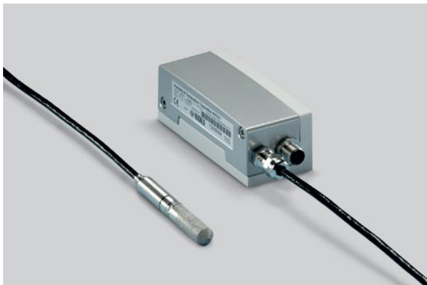
The Vaisala HUMICAP® Humidity and Temperature Transmitter HMT310 with the HMT317 probe.